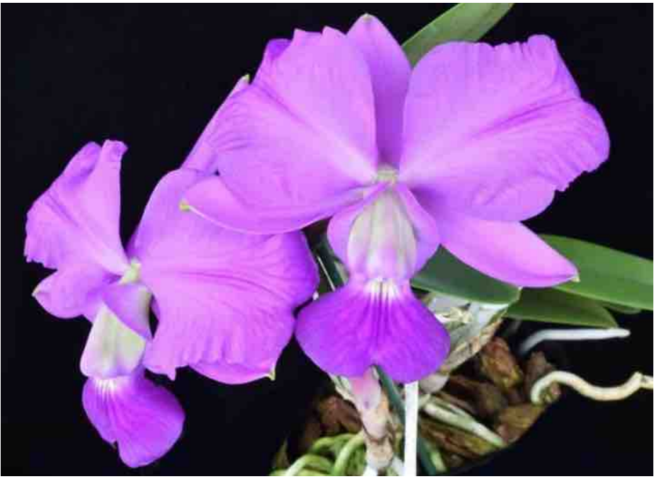
Cattleya walkeriana h.f. pseudopeloric 'Brazil 2019' JC, grown by Orchid Eros