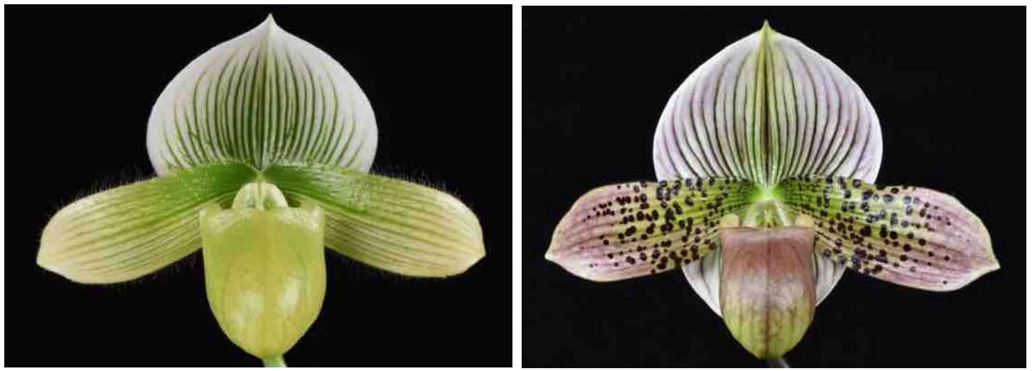
Left: Paph. Egret's Summer 'Slipper Zone Joyfully' AM/AOS, grown by Lehua Orchids Right: Paph. Pleasure in Pink 'Slipper Zone Syn Wins' AM/AOS, grown by Lehua Orchids