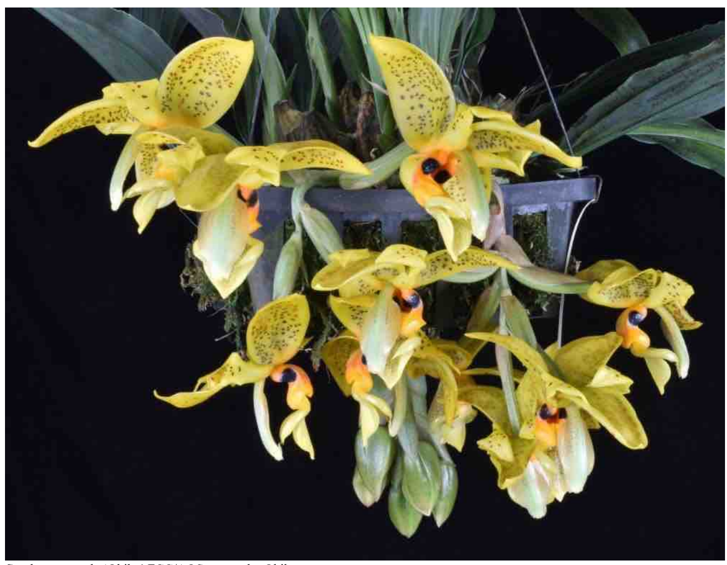
Stanhopea wardii 'Okika' FCC/AOS, grown by Okika