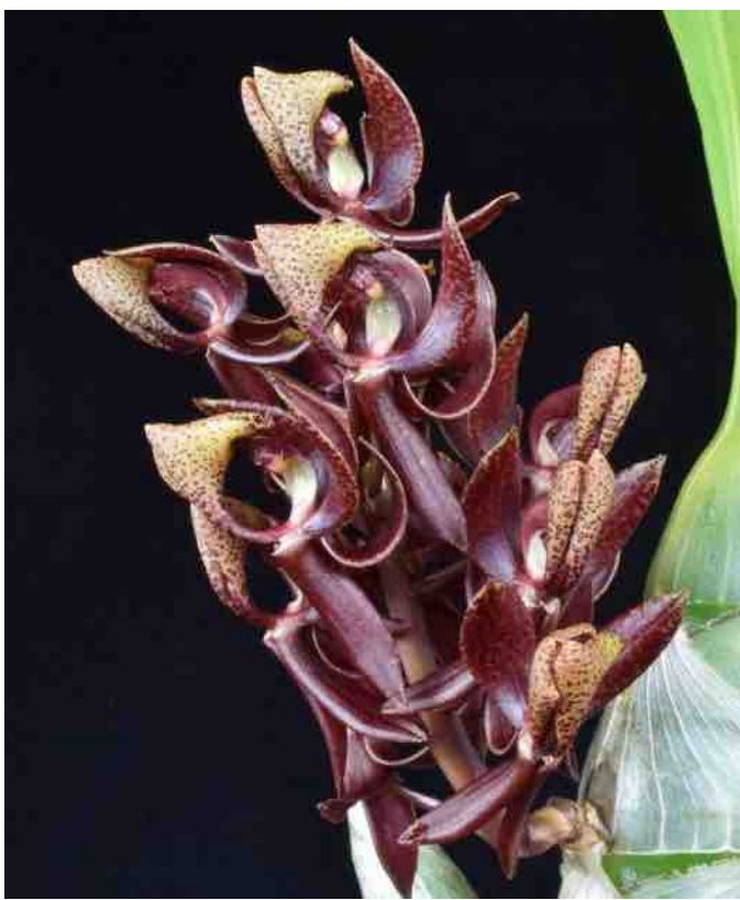
Left: Bulbophyllum treschii 'Sunday Bloody Sunday' CCM/AOS, grown by Caleb Houck Right: Mormodes tapoayensis 'Dark' CHM/AOS, grown by Hilo Orchid Farm