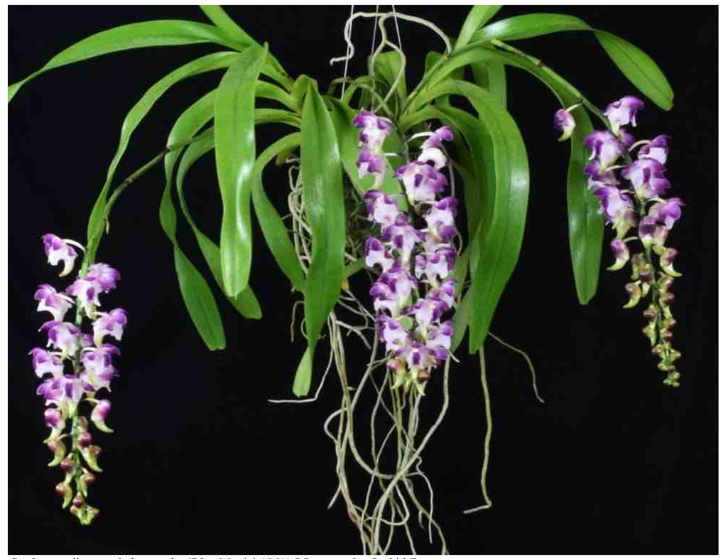
Cattleya walkeriana h.f. coerulea 'Blue Magic' AM/AOS, grown by Orchid Eros