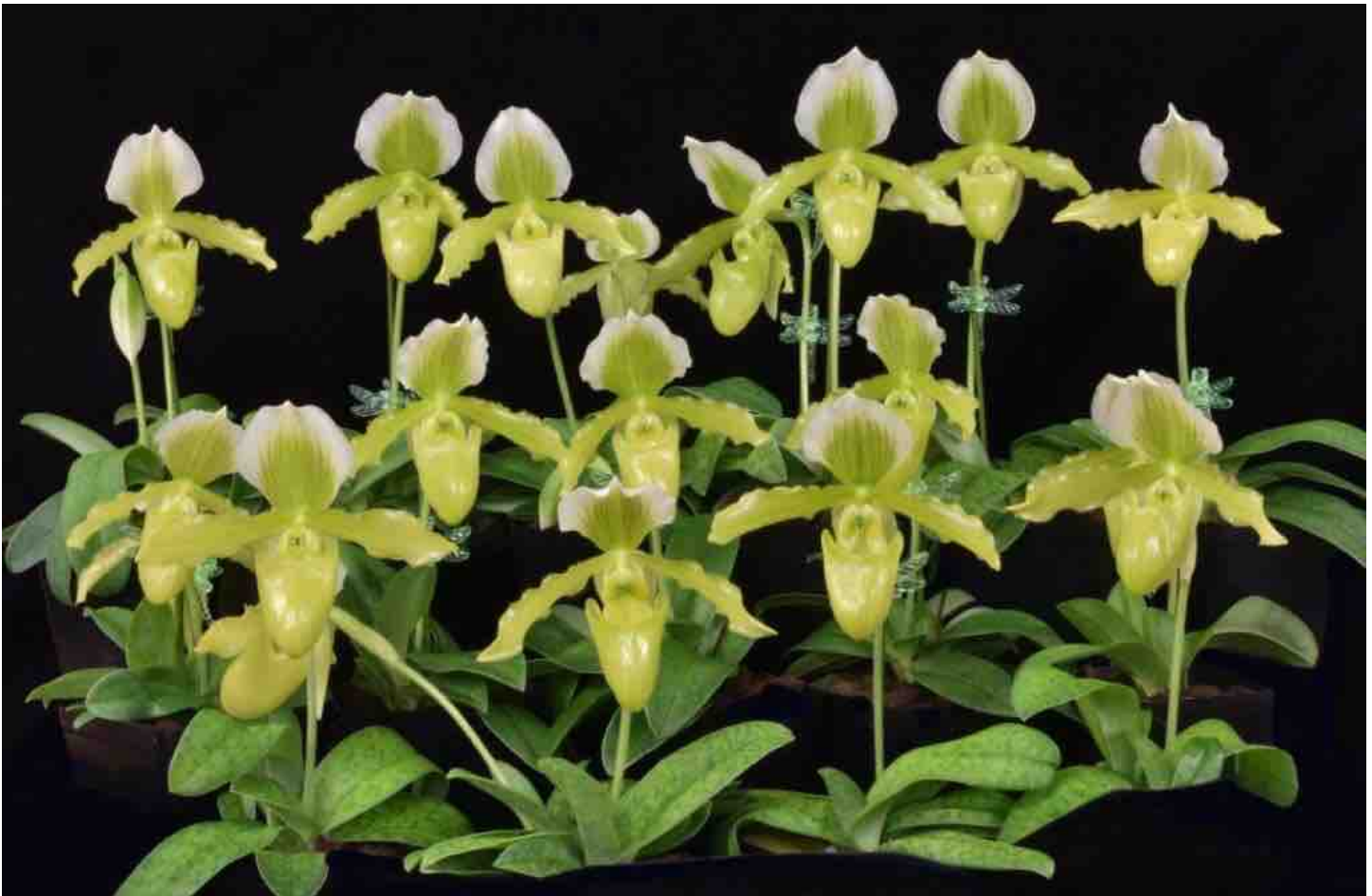
Paph. Sighing Barbie AD/AOS, grown by Lehua Orchids