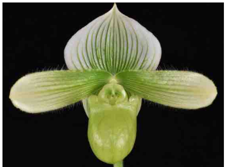
Right: Paph. Egret's Summer 'Slipper Zone Dark Smile' HCC/AOS, grown by Lehua Orchids