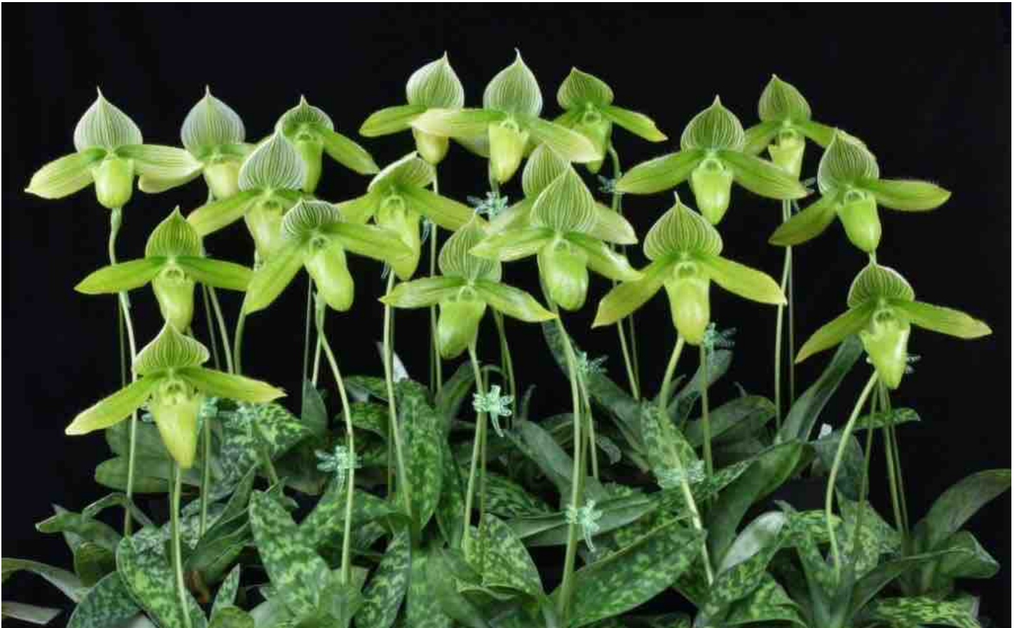
Paph. Green Sentinel AQ/AOS, grown by Lehua Orchids