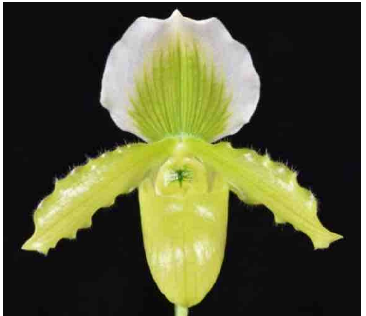
Left: Paph. Sighing Barbie 'Slipper Zone Green Wings' HCC/AOS, grown by Lehua Orchids Right: Paph. Sighing Barbie 'Slipper Zone High White' HCC/AOS, grown by Lehua Orchids