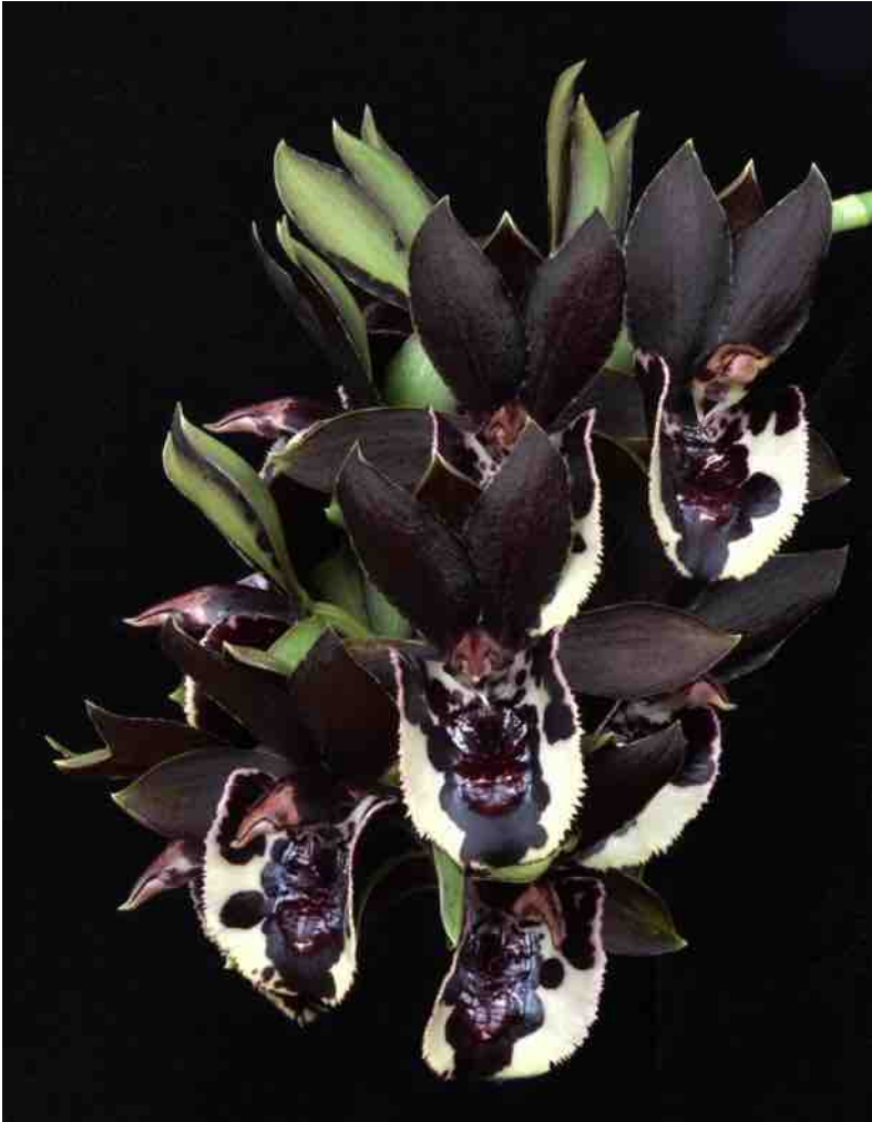
( Catamodes Darkonium x Catasetum Orchidglade ) 'Lues Midnight' HCC/AOS, grown by GLA Orchids