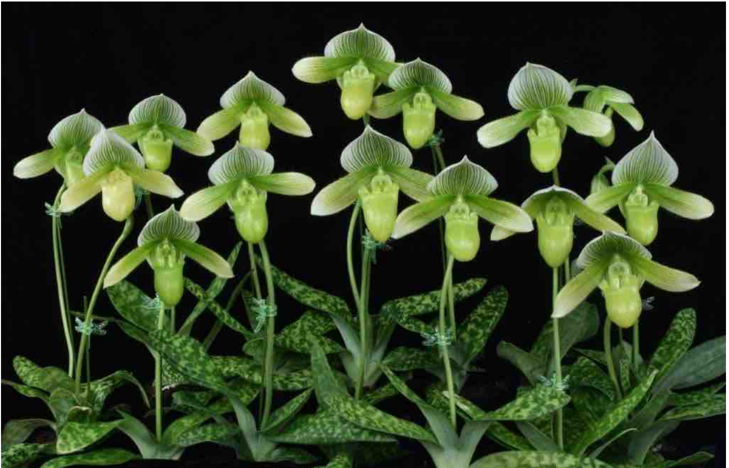
Paph. Egret's Summer AQ/AOS, grown by Lehua Orchids