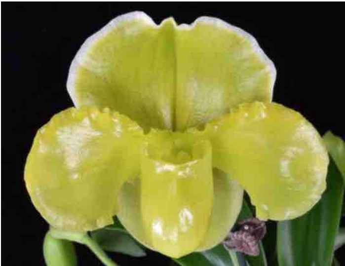
Left: Paph. Charmingly Golden 'Sandy Song' HCC/AOS, grown by Okika