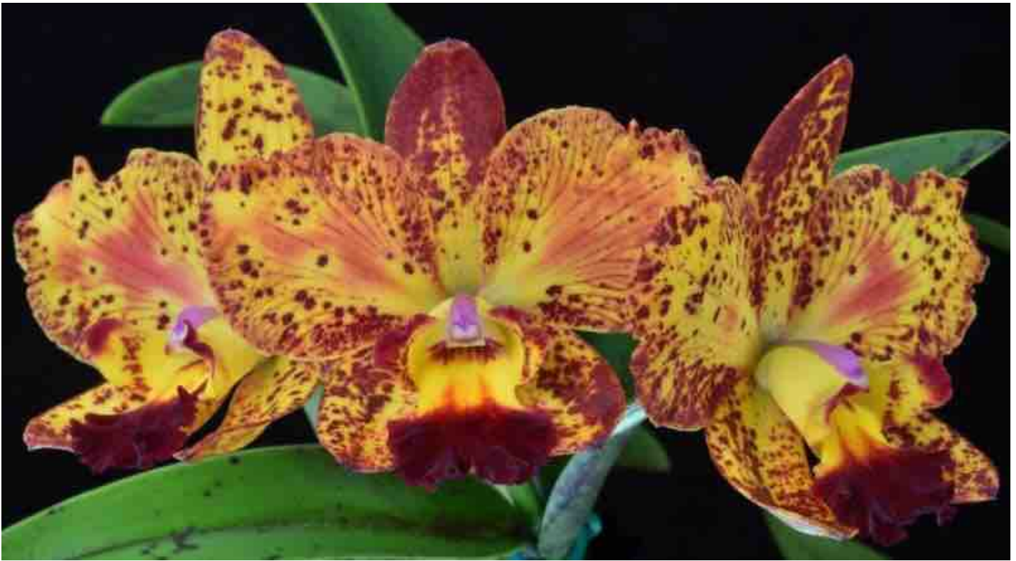
Cattleya Cosmic Future 'Lues Lava Burst' HCC/AOS, grown by Greg Leutticke-Archbell