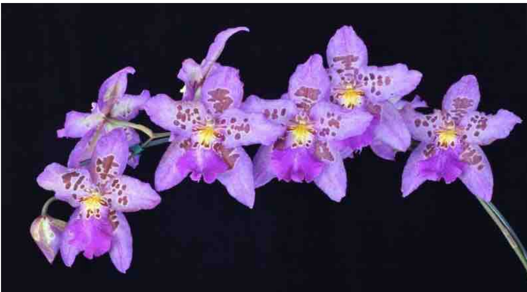
Left: Aliceara Randi 'Gay' AM/AOS, grown by Okika