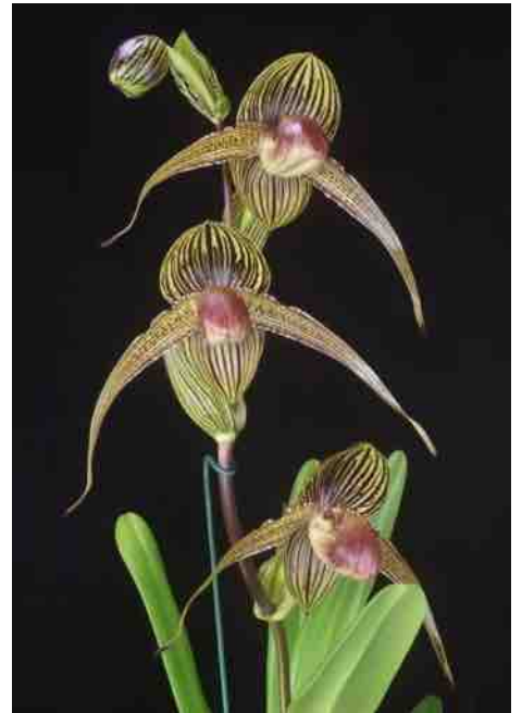
Right: Paph. Rollie Wilson 'Golden Scimitar' AM/AOS, grown by Hilo Orchid Farm