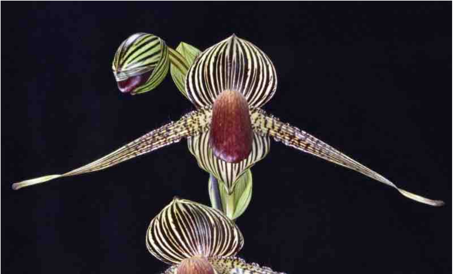
Paph. rothschildianum 'OrchidFix Bon Chance' AM/AOS, grown by OrchidFix