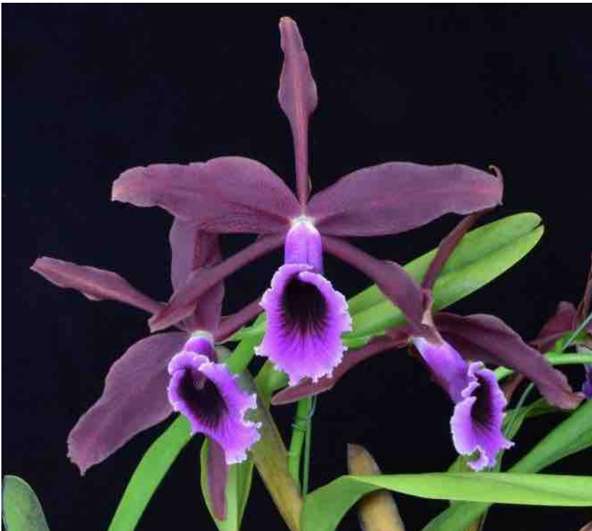
Left: Cattleya tenebrosa h.f. vinicolor 'Wine & Chocolate' AM/AOS, grown by Island Sun Orchids