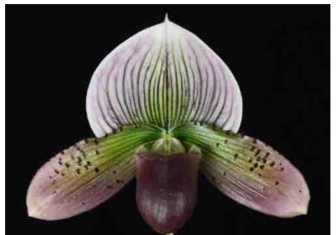
Right: Paph. Fred's Wonder 'Slipper Zone Cool Pink' AM/AOS, grown by Lehua Orchids