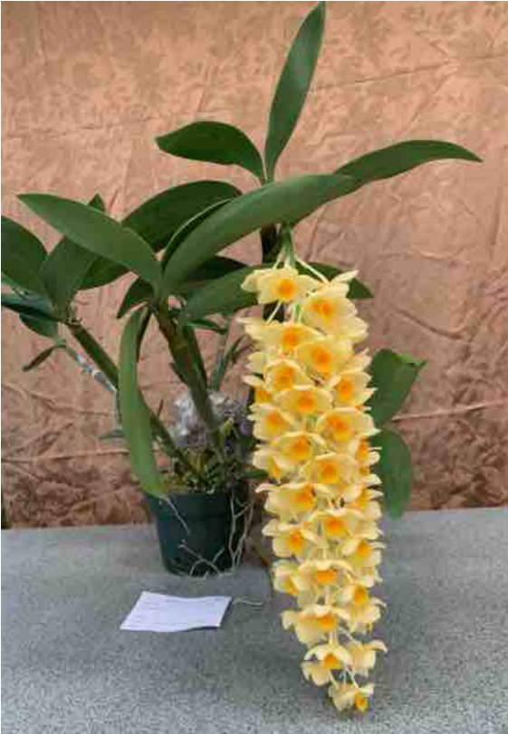
1 st place: Dendrobium densiflorum , grown by Julie Goettsch