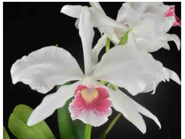
Right: Cattleya purpurata h.f. carnea 'Orchid Eros' HCC/AOS, grown by Orchid Eros