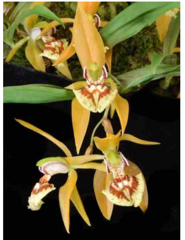
Right: Coelogyne schilleriana 'Goldilocks' AM/AOS, CCM/AOS, grown by Island Sun Orchids