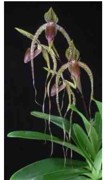
Right: Paph. Prince Edward of York 'Lehua Who Knows' AM/AOS, grown by Lehua Orchids