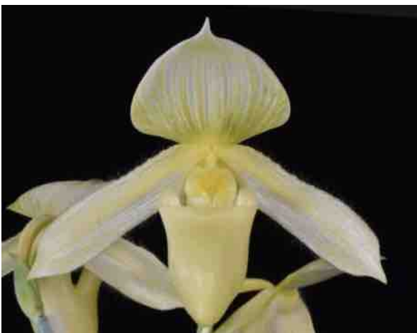
Paph. Oriental Desire 'Slipper Zone Allure' AM/AOS, grown by Lehua Orchids