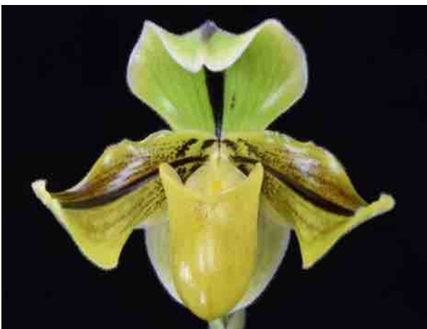
Left: Paph. druryi 'Lehua Radiant' AM/AOS, grown by Lehua Orchids