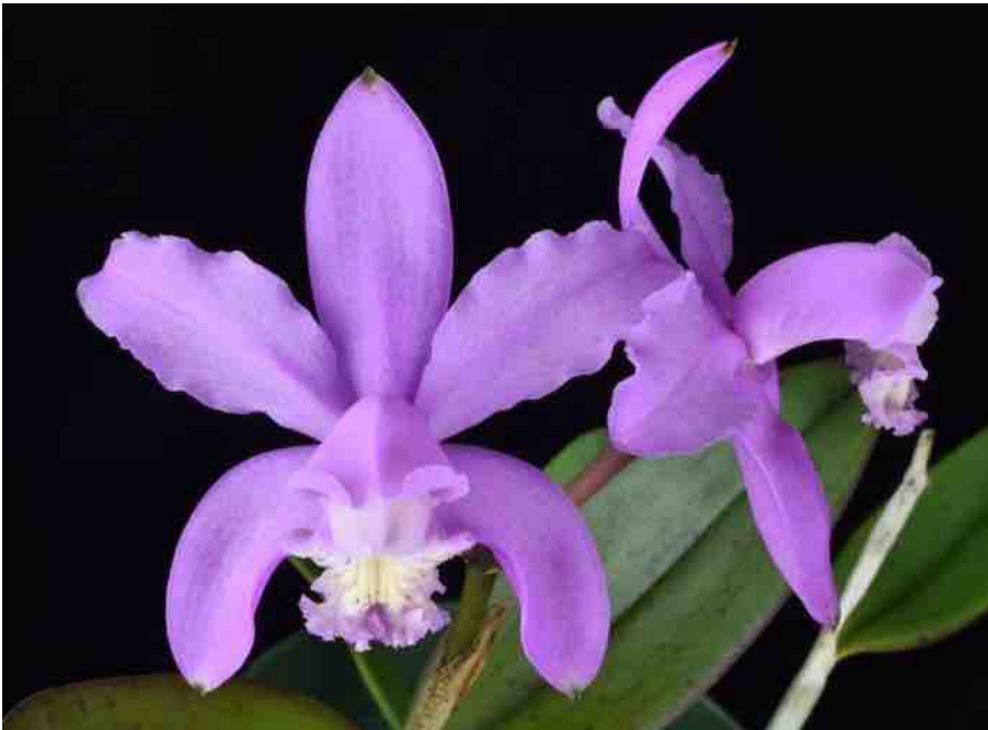
Left: Cattleya kerrii 'Lues Twins' AM/AOS, grown by GLA Orchids