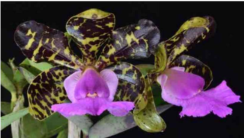
Left: Cattleya aclandiae 'Bodacious' AM/AOS, grown by Orchid Eros