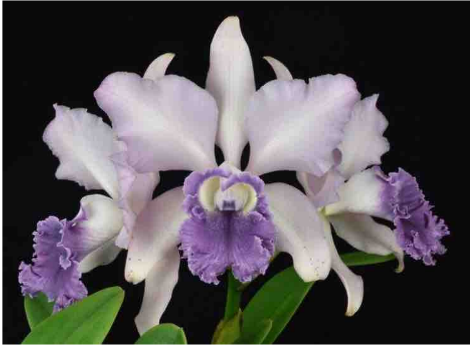
Left: Paph. French Wonder 'Slipper Zone Double Up' HCC/AOS, grown by Lehua Orchids Right: Cattleya Saxe Blue Jewel 'Billy B' AM/AOS, grown by GLA Orchids