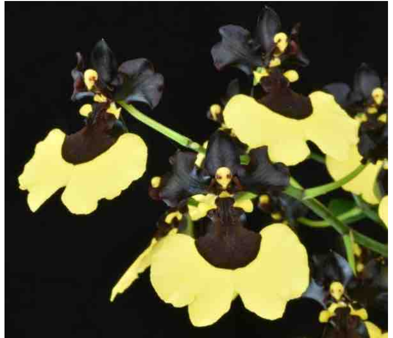
Left: Cattleya warscewiczii 'Put On Your Dancing Shoes' FCC/AOS, grown by Orchid Eros Right: Gomesa Jiaho Queen 'Jiaho' FCC/AOS grown by Hilo Orchid Farm