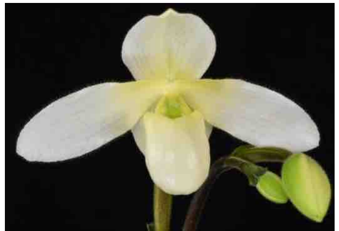
Left: Paphiopedilum Henrietta's Charm 'Slipper Zone Tall Grace' AM/AOS, grown by Lehua Orchids Right: Paphiopedilum Henrietta's Charm 'Slipper Zone White Grace' HCC/AOS, grown by Lehua Orchids