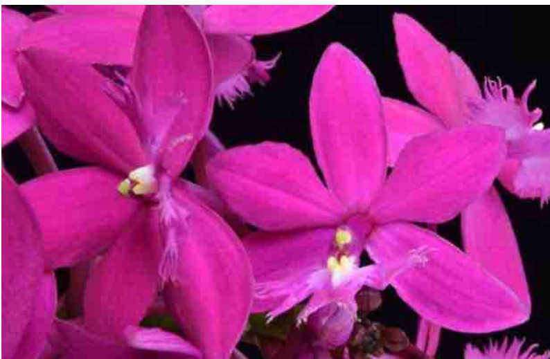
Epidendrum Sky Cloud 'Night Out' AM/AOS, grown by Orchid Eros