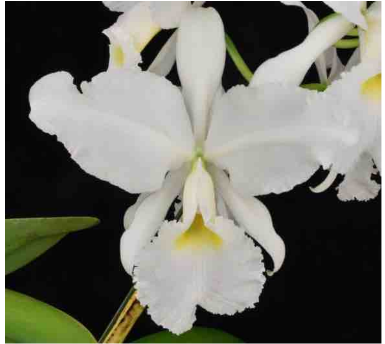
Left: Cattleya warscewiczii h.f. alba 'Cumbre Blanca' HCC/AOS, grown by Orchid Eros Right: Cattleya warscewiczii h.f. alba 'Graduation Day' AM/AOS, grown by Orchid Eros