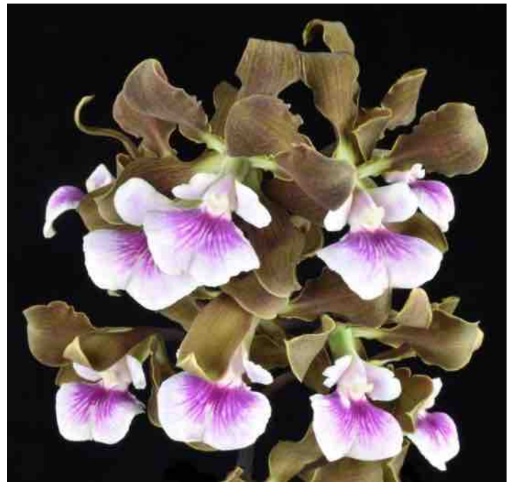
Left: Cattleya warscewiczii h.f. coerulea 'Sanson' AM/AOS, grown by Orchid Eros Right: Encyclia randii 'Sebastian Ferrell' AM/AOS, grown by Orchid Eros