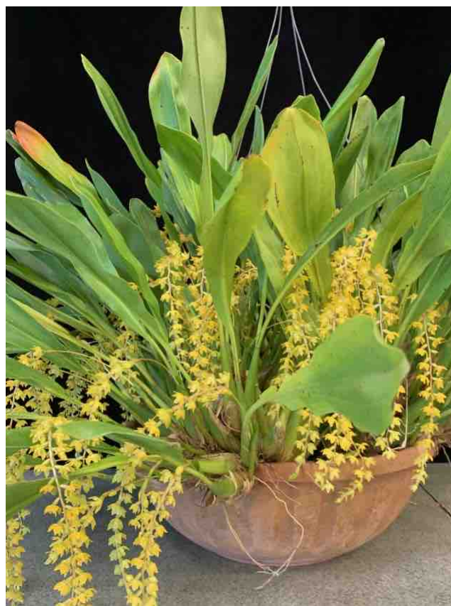
Left: 1 st place: Cattleya maxima (fina alba x 'Peruvian Pearl') grown by Lise Dowd Right: 2 nd place (tie): Dendrochilum species, grown by Janice Williams