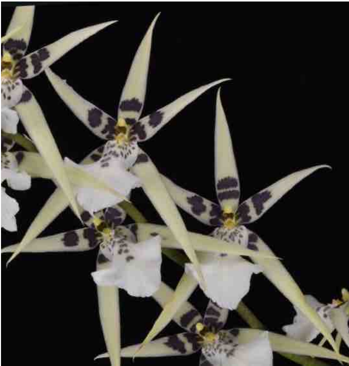
Left: Miltassia Phoenix Rising 'White Light' AM/AOS, grown by Okika Right: Miltoniopsis Rubenesque 'Survivor' AM/AOS, grown by Okika