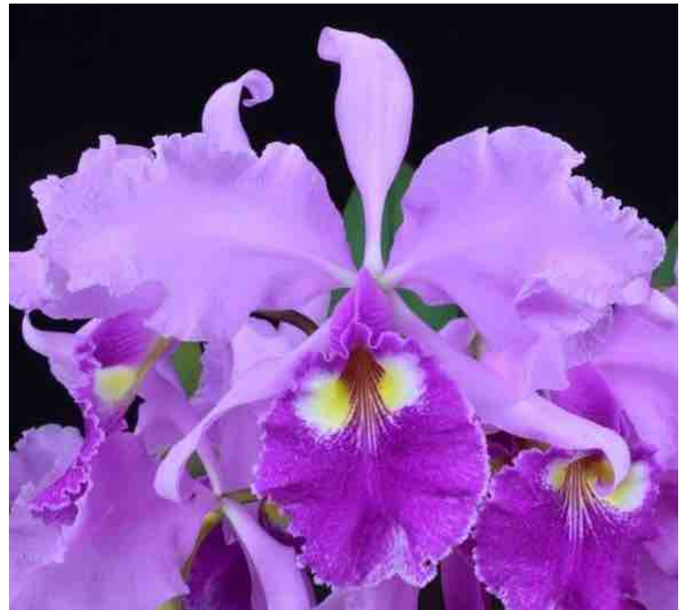
Left: Cattleya mendelii 'From Pacho' HCC/AOS, CHM/AOS, grown by Orchid Eros Right: Cattleya warszewiczii 'Island Sun Orchids' AM/AOS, grown by Island Sun Orchids