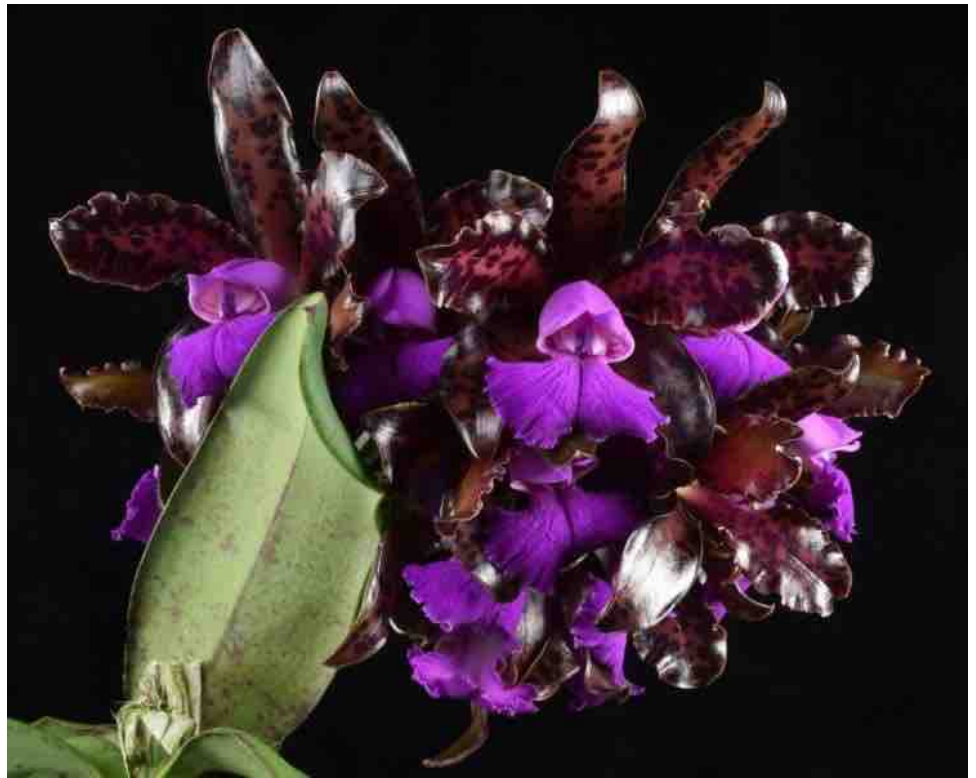
Left: Bulbophyllum Wilbur Chang 'Rotten Sunset' AM/AOS, grown by Jungle Mist Orchids Right: Cattleya Mareeba Tiger 'Darth Vader' AM/AOS, grown by Orchid Eros