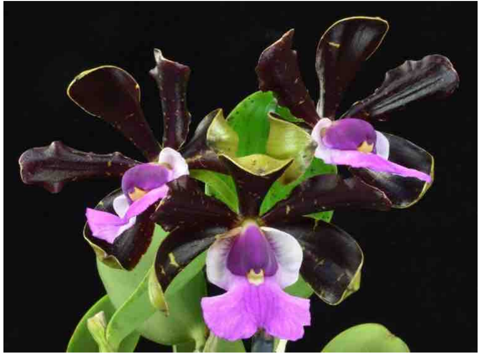
Left: Aspasiium Gloria Barfield 'Gay Barfield' AM/AOS, AD/AOS, grown by Okika Right: Cattleya aclandiae h.f. nigrescens 'Alice Cooper' AM/AOS, grown by Orchid Eros