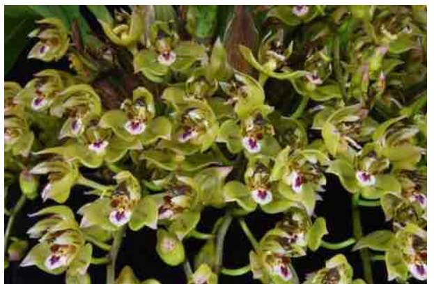
Left: Cattleya rex 'Tepal Flares' HCC/AOS, grown by Orchid Eros Center: Cattleya warszewiczii 'Nutibara' JC/AOS, grown by Orchid Eros Right: Thecopus maingayi 'Shogun Hawaii' HCC/AOS, grown by Shogun Hawaii