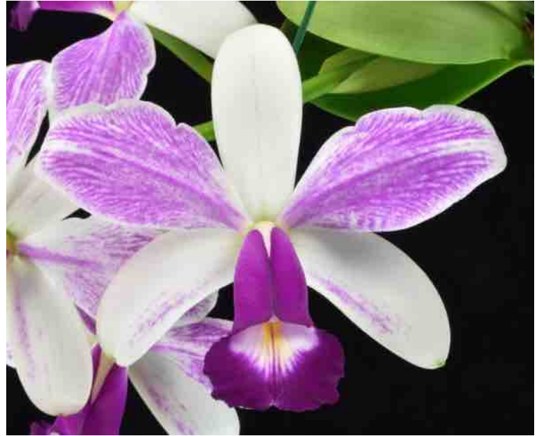
Left: Cattleya violacea h.f. flammea 'Fantasia' FCC/AOS, grown by Orchid Eros Right: Cattleya violacea h.f. flammea 'Trifle' FCC/AOS, grown by Orchid Eros