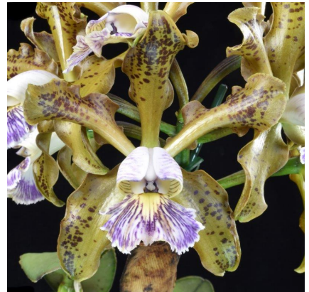
Left: Cattleya schilleriana 'Mu'u Mu'u' AM/AOS, grown by Orchid Eros Center: Cattleya schilleriana 'Too Much' AM/AOS, grown by Orchid Eros Right: Cattleya schilleriana h.f. coerulea 'Tab Benoit' AM/AOS, grown by Orchid Eros