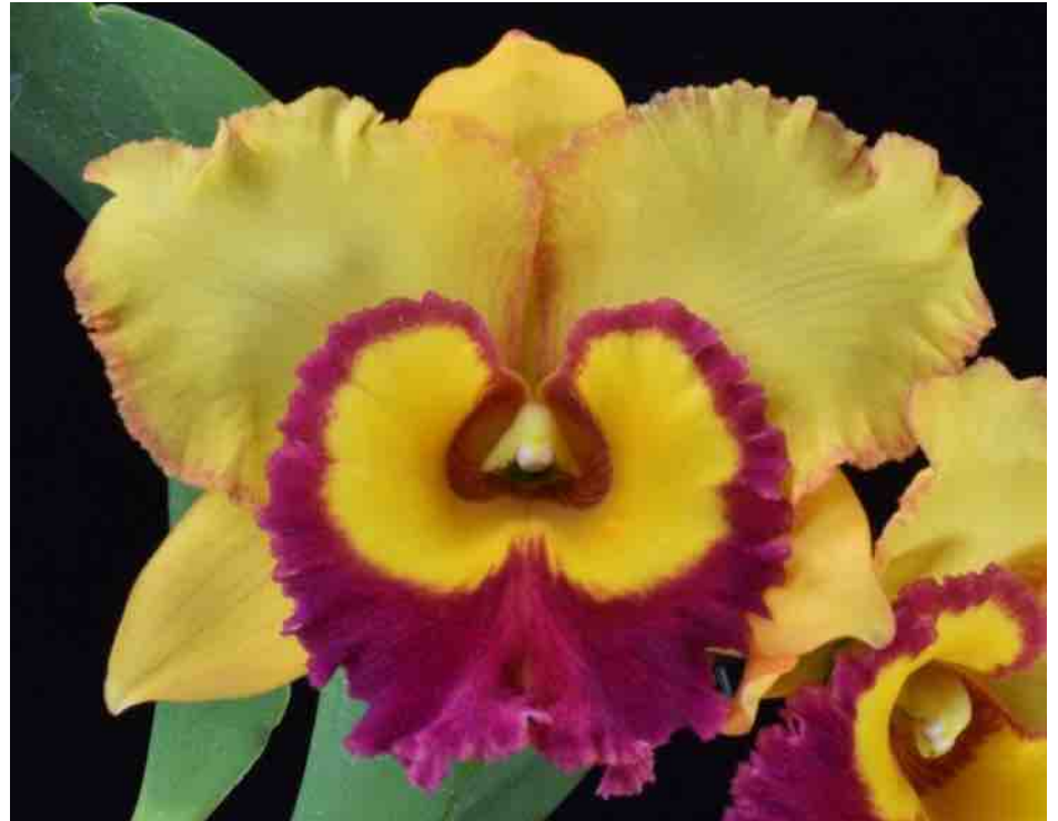
Left: Paph. Chiu Hua Dancer 'Okika' AM/AOS, grown by Okika Right: Rlc. Thaksina Gold '#3' AM/AOS, grown by Shogun Hawaii