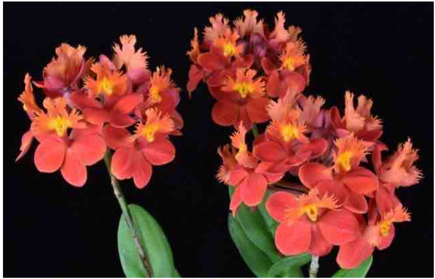
Epidendrum Pacific Blaze 'OrchidFix Great Balls of Fire' AM/AOS, grown by OrchidFix