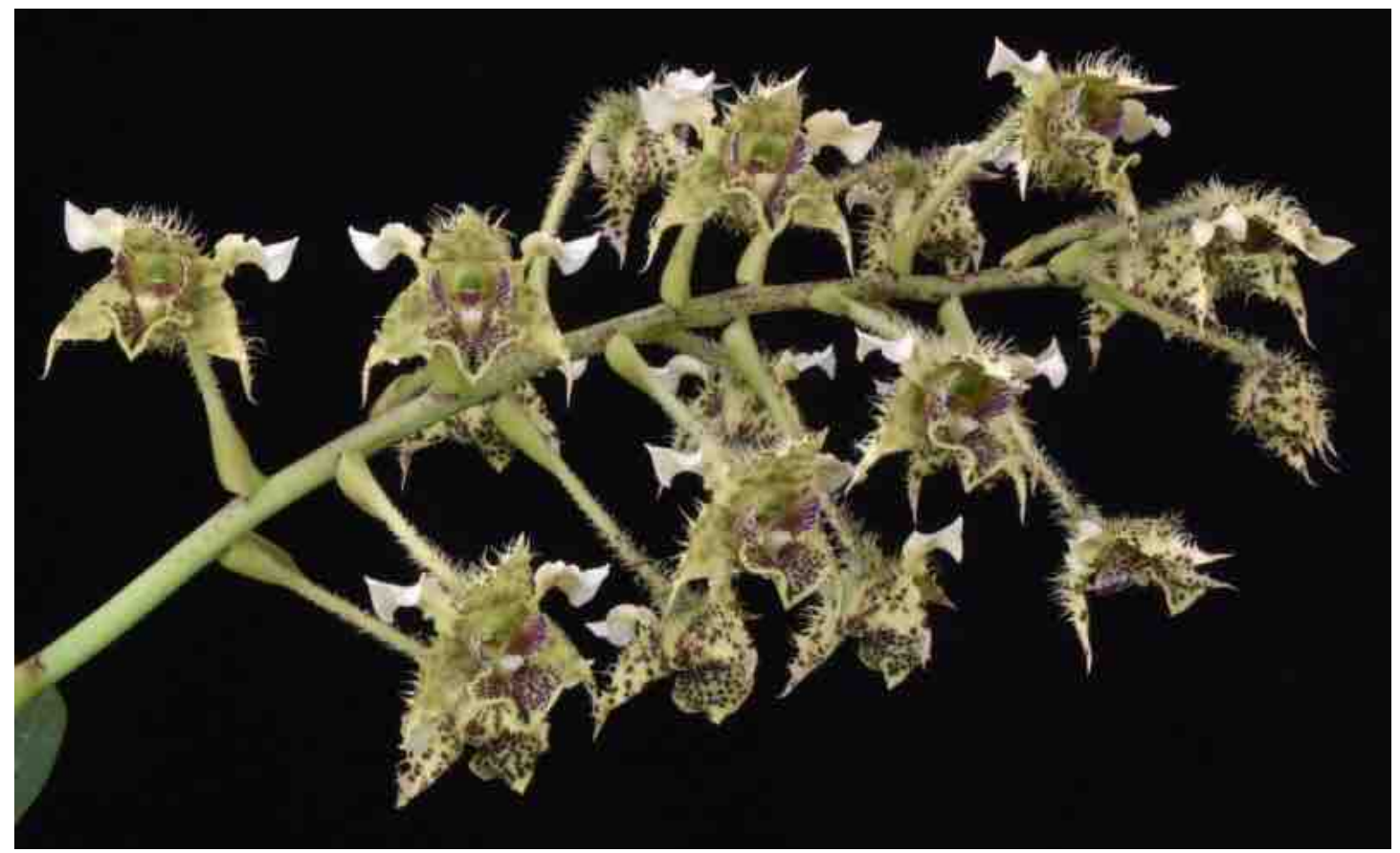
Dedrobium polysema 'Eat Me' AM/AOS, grown by Jungle Mist Orchids