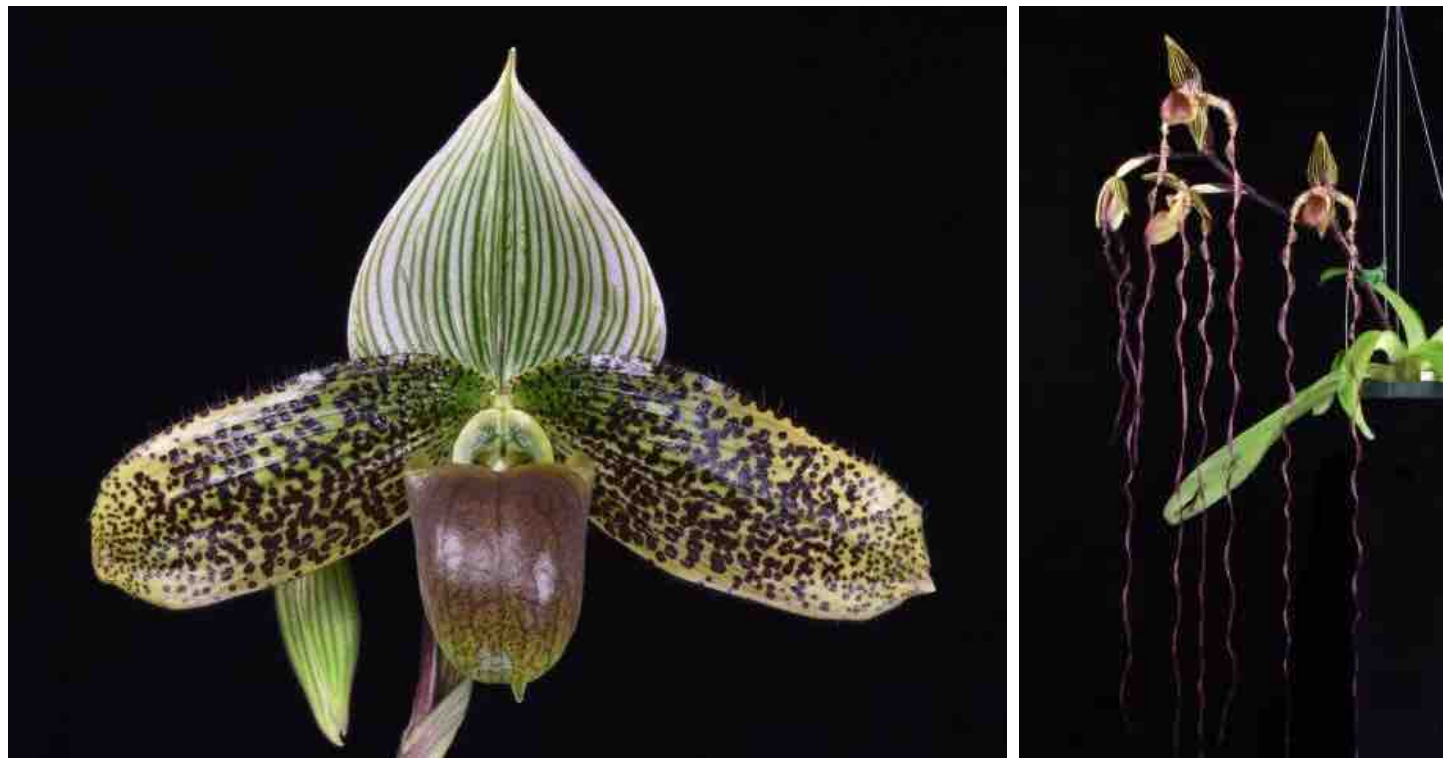
Left: Paphiopedilum Enchanting Knight 'Slipper Zone That's Better' AM/AOS, grown by Lehua Orchids Right: Paphiopedilum sanderianum 'Come to Me' AM/AOS, grown by OrchidFix