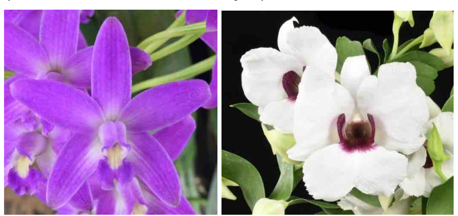
Left: Cattleya rupestris 'Okika' AM/AOS, grown by Okika Right: Dendrobium Snow Festival '808 Orchids' AM/AOS, grown by Mindi Clark