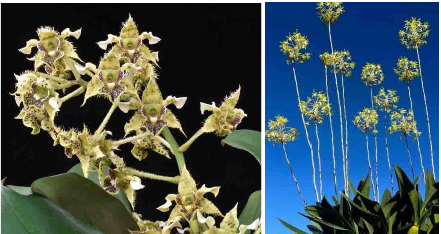
Left: Dendrobium polysema 'Suck on This' AM/AOS, grown by Jungle Mist Orchids Right: Laelia undulata h.f. alba 'Shogun Hawaii' CCE/AOS, grown by Shogun Hawaii