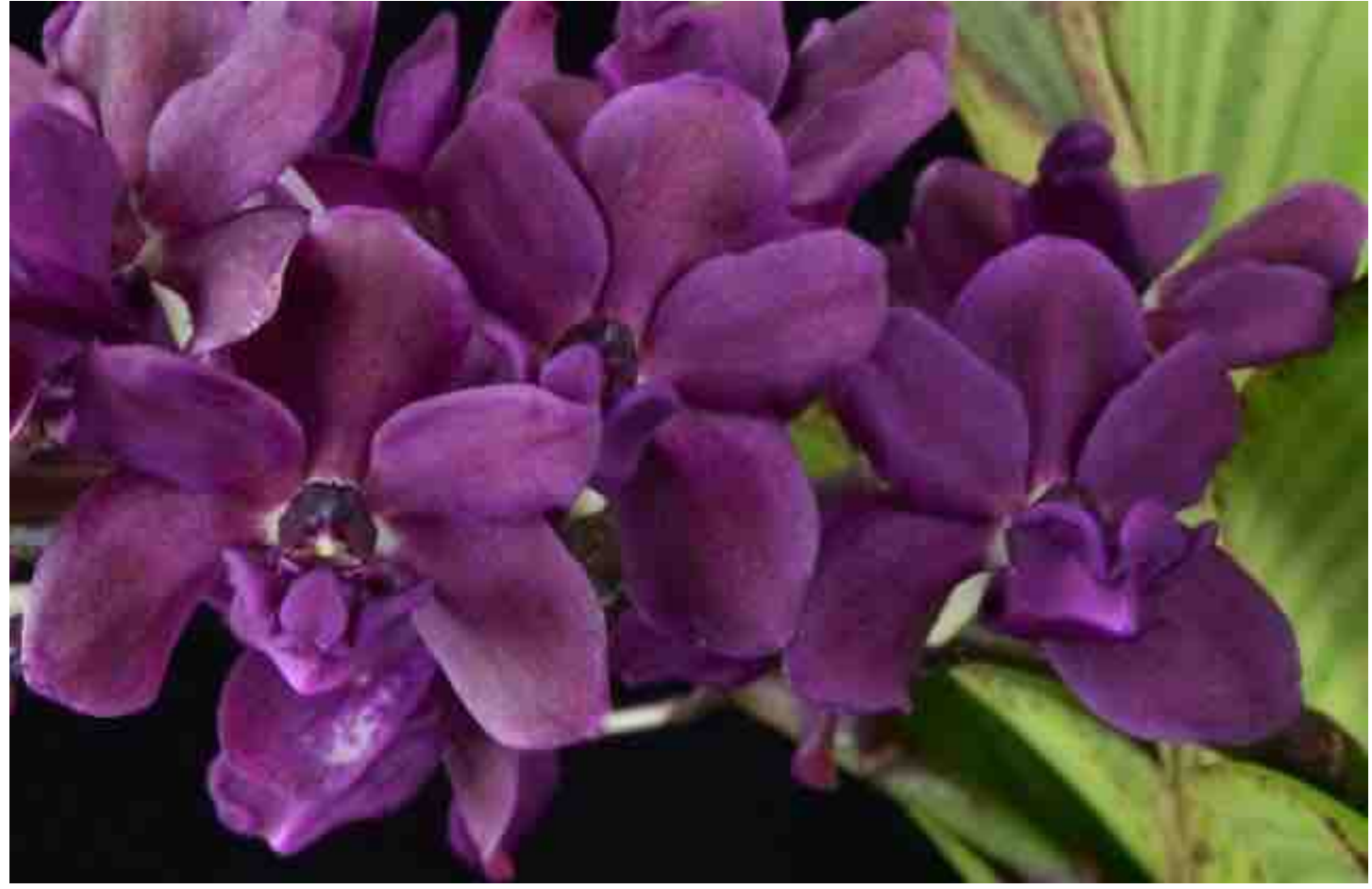
Rhynchostylis gigantea 'Excellent' AM/AOS, grown by Shogun Hawaii