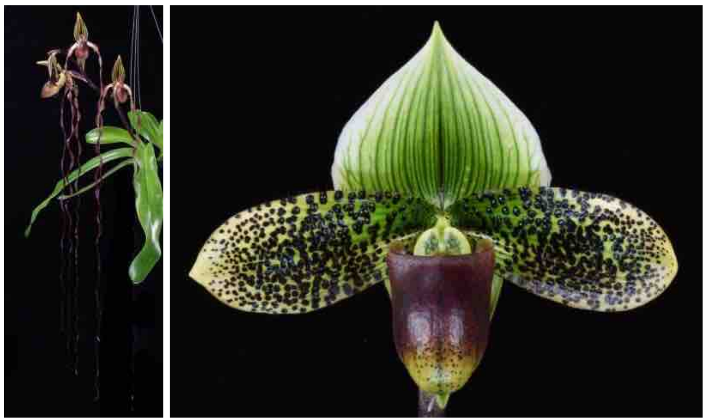
Left: Paphiopedilum sanderianum 'Lily's Heavenly Palace' AM/AOS, grown by OrchidFix Right: Paphiopedilum Lune Francais 'OrchidFix, Thanks Slipper Zone' AM/AOS, grown by OrchidFix