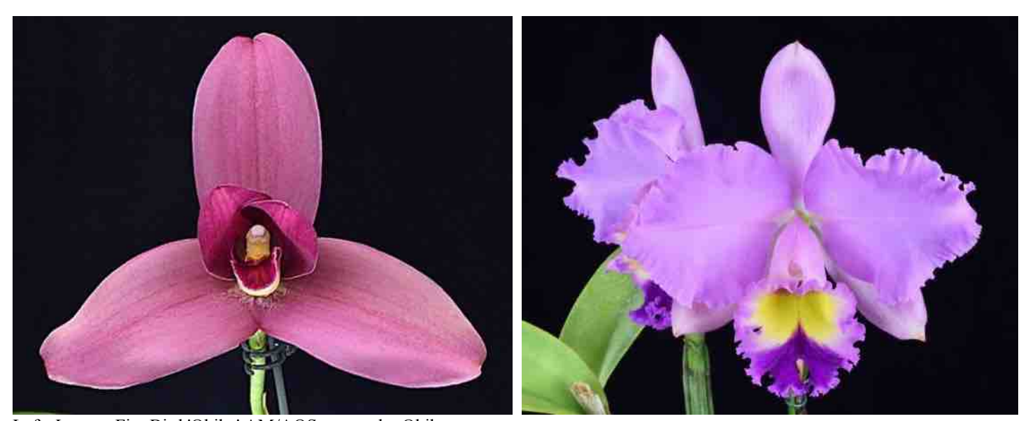
Left: Lycaste Fire Bird 'Okika' AM/AOS, grown by Okika Right: Rlc . Princess of Hawaii 'Shogun's Success' AM/AOS, grown by Shogun Hawaii